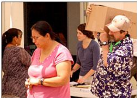
Orange County Rescue Mission Food Distribution