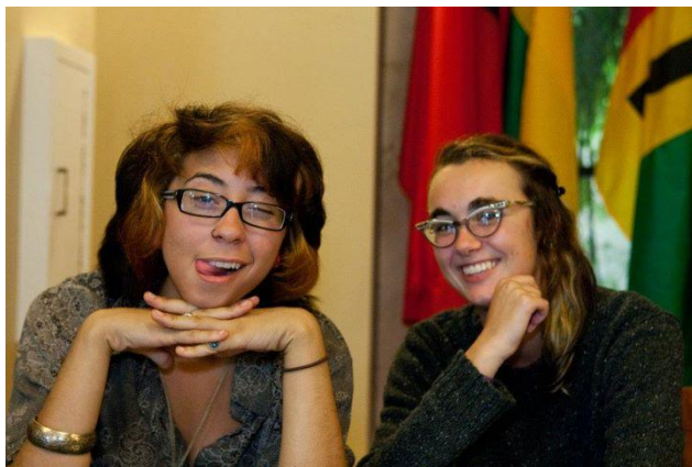
Activist Collective co-presidents for