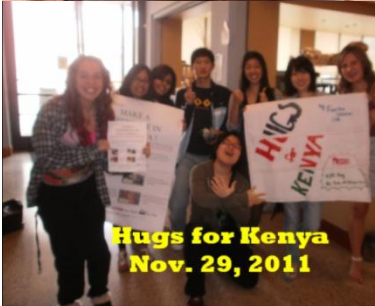
Hugs for Kenya Nov. 29, 2011